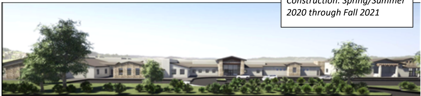
Solana Vista Elementary Construction: Spring/Summer 2020 through Fall 2021

In 2018, the District, in collaboration with San Dieguito Union High School District (SDUHSD), won the 2018 Regional Golden Watchdog Award from the San Diego County Taxpayers Association for collaboration on interim housing at SDUHSD’s Earl Warren Middle School during the construction of SBSD’s Skyline Elementary School.