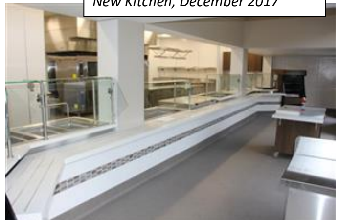
Solana Highlands Modernization, New Kitchen, December 2017